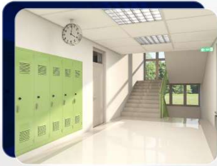
Floor Types, hallways